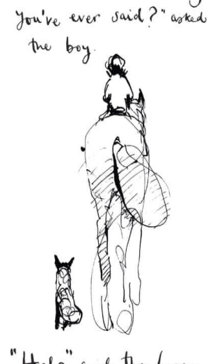
"Help, said the horse.

human need and desire for people to come alongside