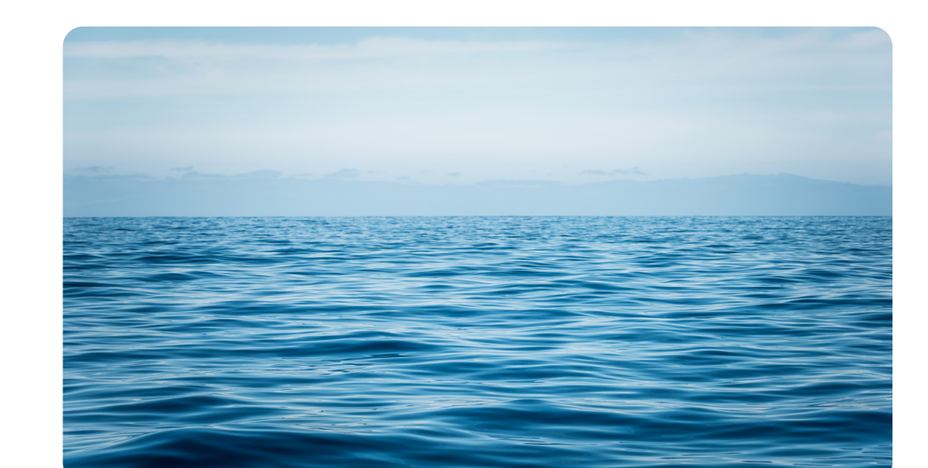
The ocean is a body of salt water that covers over two thirds of the surface of the Earth. The largest ocean is the Pacific Ocean.

Carnivores eat other animals. Herbivores eat plants. Omnivores eat plants and other animals.